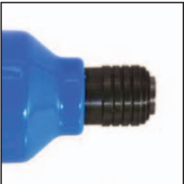
MP2264B with 1/4" Hex Quick Change Bit Holder