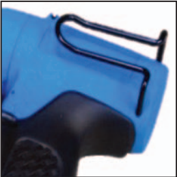
Detachable clip adds versatility while staying out of the way